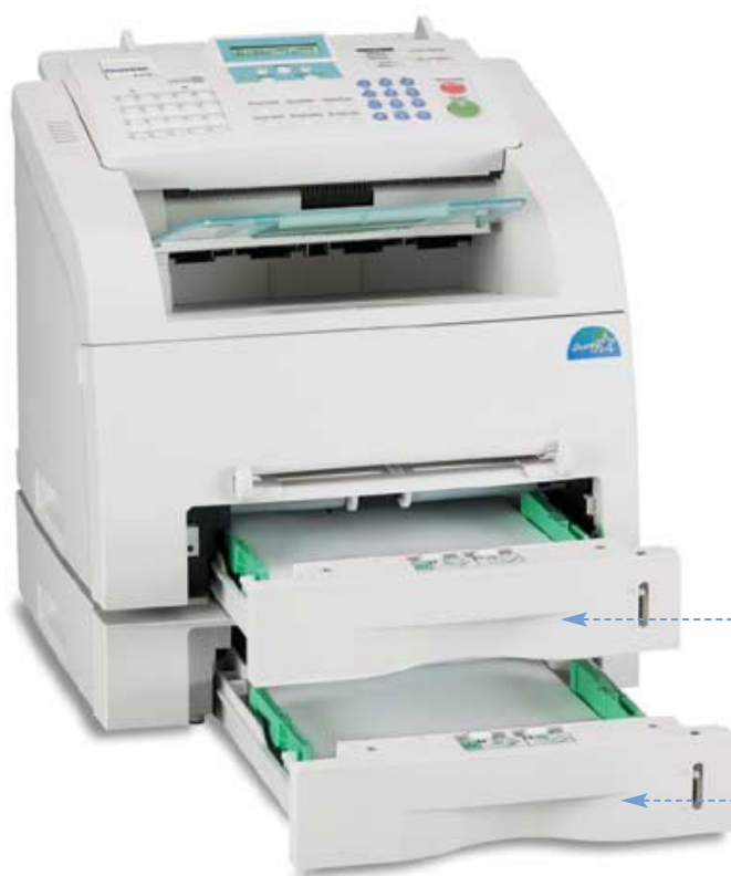
250-Sheet Paper Tray