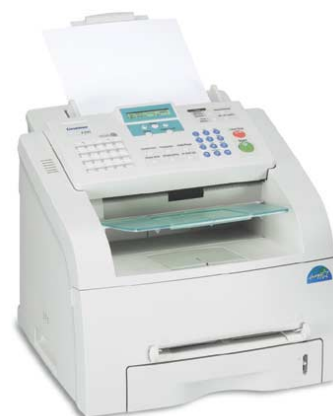
The 50-sheet Automatic Document Feeder scans and stores multi-page outgoing faxes.

Receiving faxes is equally simple. Incoming faxes automatically print at a fast 17 ppm at 600 dpi resolution or, if your F270 runs out of paper, they go directly to memory. Once stored, your important business communications are protected from deletion with the F270's 72 Hour Battery Backup, which means that you